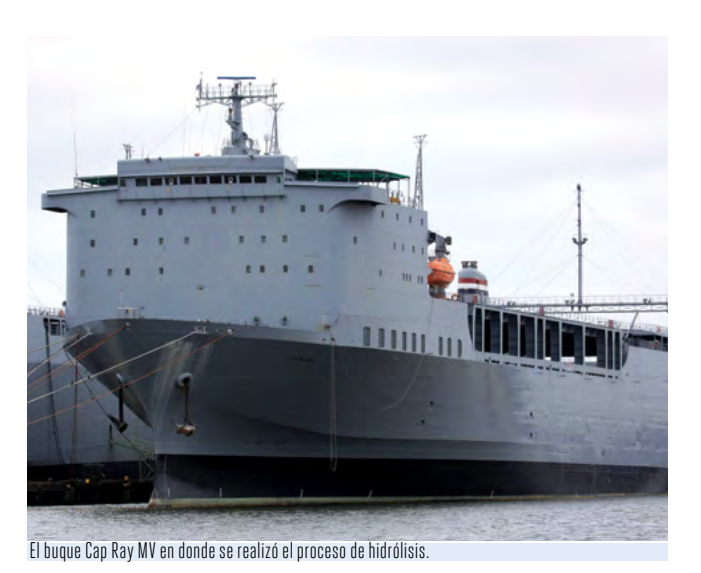
Proceso de hidrólisis desarrollado dentro del buque

In spite of the initial plans of the Organization for the Prohibition of Chemical Weapons to eliminate the most toxic agents before the end of the year and the rest by mid-February, these plans were delayed by a mixture of legal, environmental and security challenges. However, Denmark, Italy and Norway confirmed the shipment of