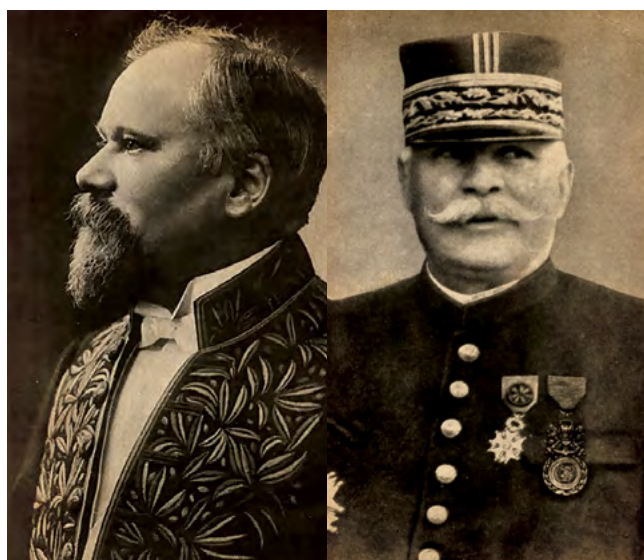
President of France Raymond Poincaré and Chief of Staff General Joseph Joffre

The defeat during the French- Prussian War had important consequences on the French military spirit. Doctrines were revised and concepts were modified.