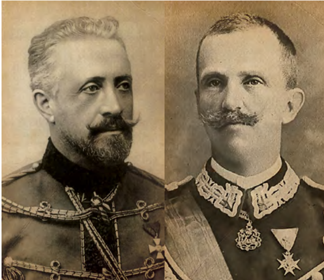
Great Duke Nicholas Nikoláyevich and Vittorio Emanuele III

visit to the troops in 1915 when he was already 71 years old was recorded. His last public appearance was on December 1, 1918 when he was proclaimed King of the Serbians, Croats and Slovenians. He died in Belgrade in 1921 when he was 77 years old.