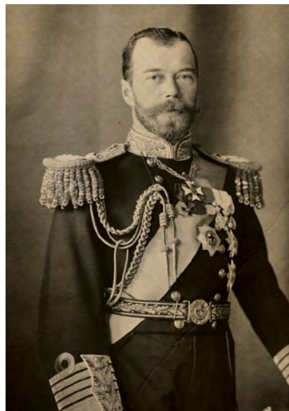
Nicholas II, Tsar of Russia