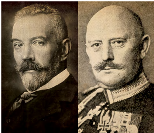
Chancellor Theobald von Bethmann Hollweg and General Helmuth Johan von Moltke

As from the creation of the Triple Alliance, formed by Germany, Austria-Hungary and Italy and of the Triple Entente formed by Great Britain, France and Russia, this period is known as Armed Peace.