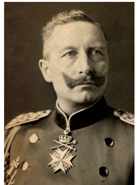
William II, Emperor of Germany