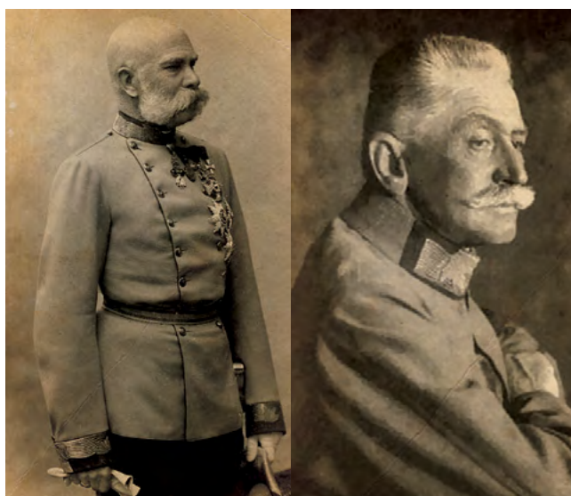
Emperor Franz Joseph I and General Franz Conrad von Hotzendorf

His nephew, the Archduke Franz Ferdinand (1863- 1914) became, in 1896, the heir after a series of death events in the Habsburg family and had a great influence on the Empire.