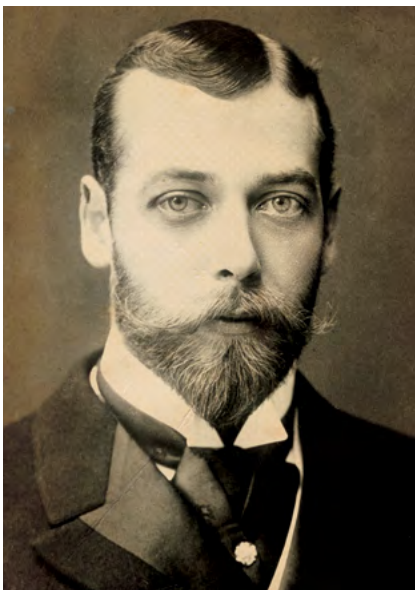
George V, King of England

In 1914, none of the nations which were later involved, wanted a widespread war. The one that was in the least